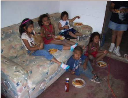
Hot Dogs, Beans and Chips. Yummy

As many of you know, our role is to come along side Native pastors and provide encouragement, disciple, and provide behind the scenes support. We partner with the Native pastors but they lead the church as we serve where they direct us.